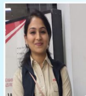
Renuka Mahindra Automobile, Bhilai