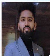
Yogesh HDFC training centre, Mumbai