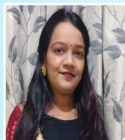
Swati IIFL Finance